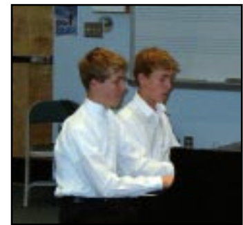
The Duet Recital was a highlight of the state conference in Farmington.

Other chairs (MTNA competitions especially), chime in, please. Some might call